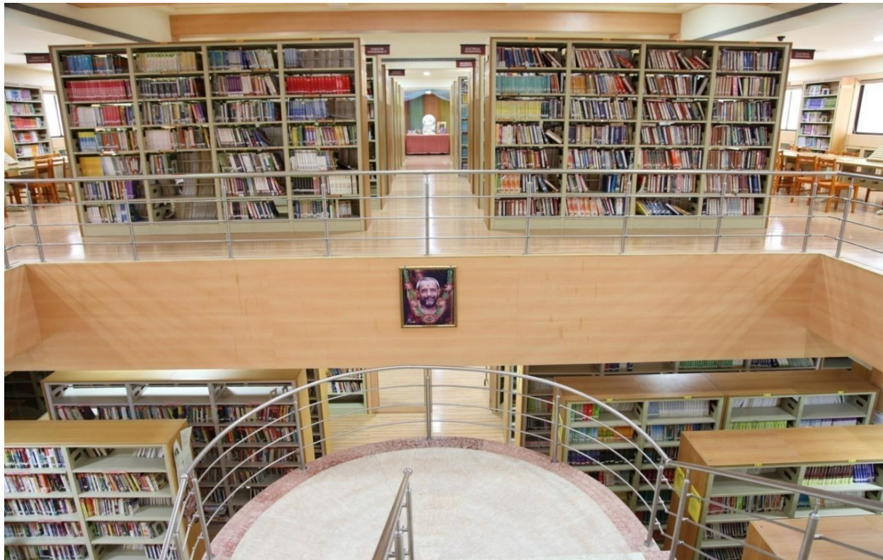
Figure 7: Books stacks shelving in the Atmiya University Library