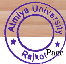
Fig 10. E-corner Kindat Atmiya University Library