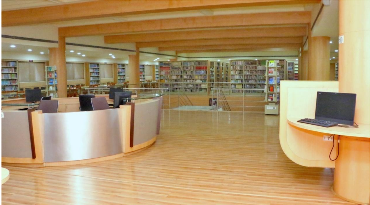
Figure 3: Circulation Counter and OPAC search machine