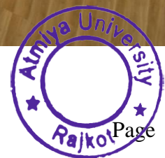
Figure 8: Glimpses Atmiya University Library