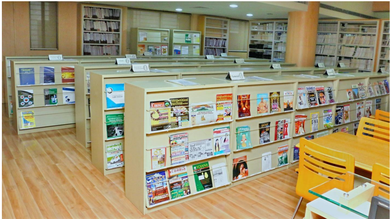
Figure 6: Print Periodicals Section in the Atmiya University Library