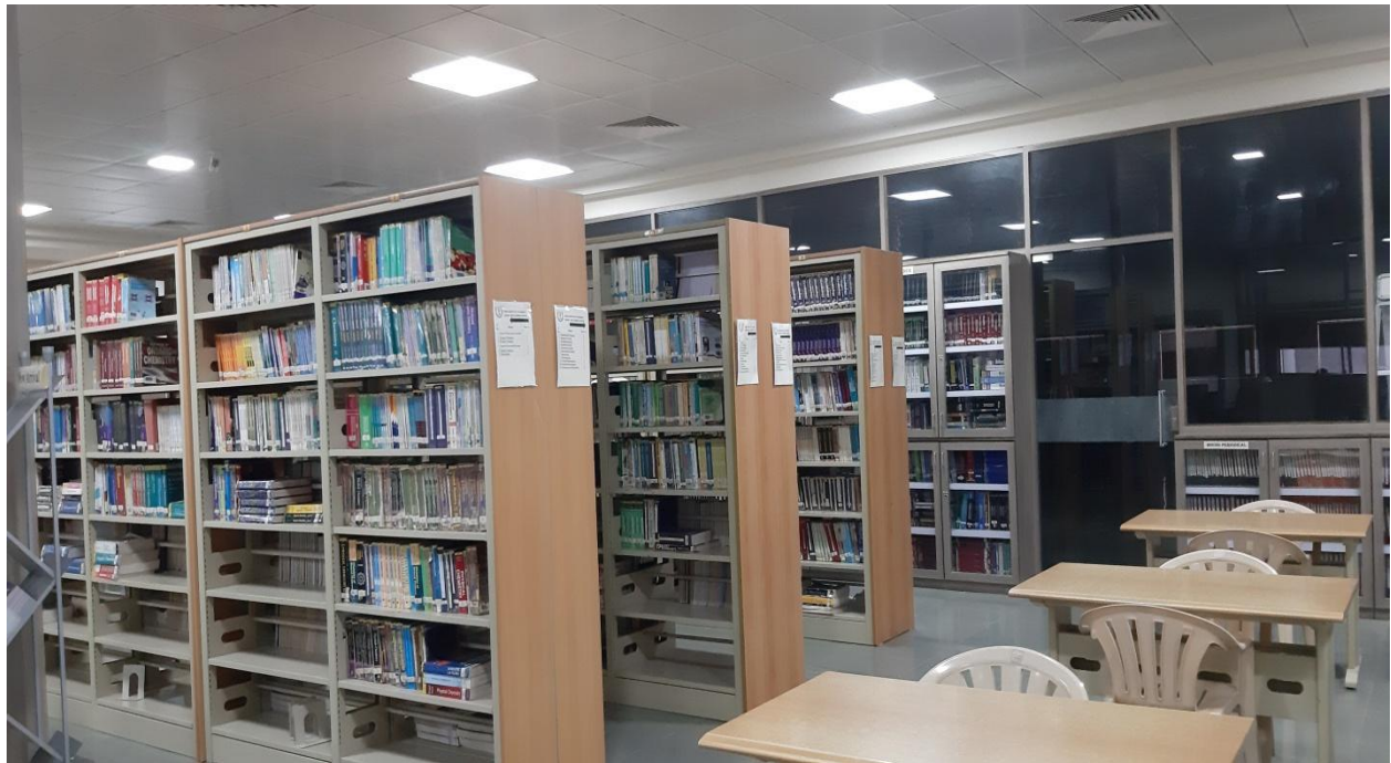
Fig 23. Stack and reading area Pharmacy Library, Atmiya University