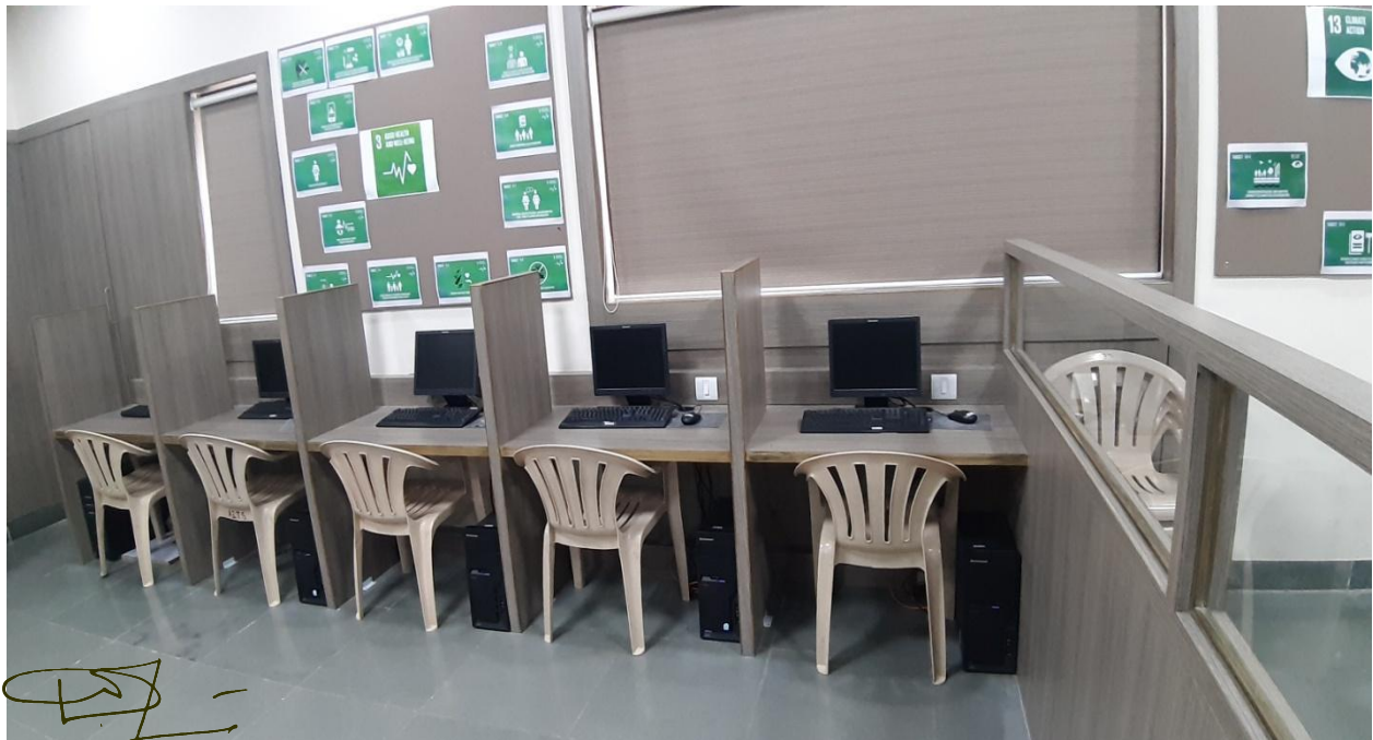
Fig 24. E-library facility Pharmacy Library, Atmiya University