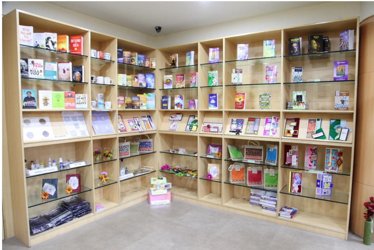
Fig 18 Bookshop in Atmiya University Library