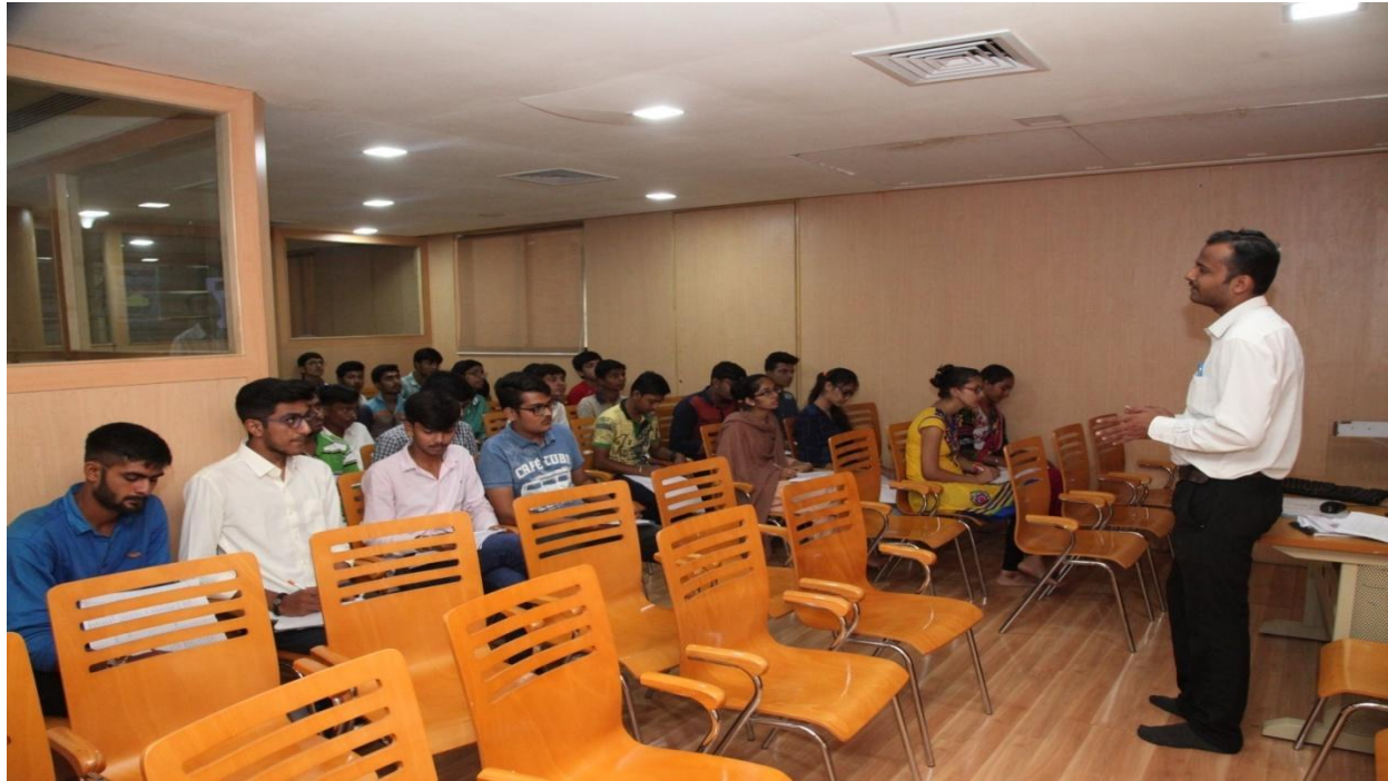
Figure 9: Media library in the Atmiya University Library