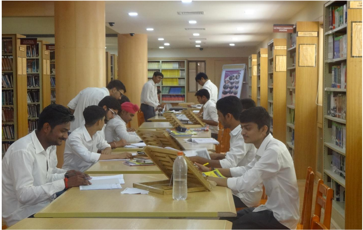
Figure 4: Reading area in the library