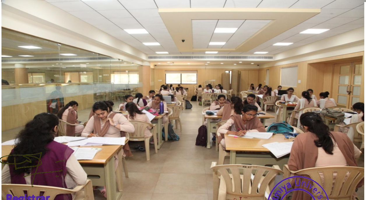
Fig 12: Reading Room Atmiya University Library