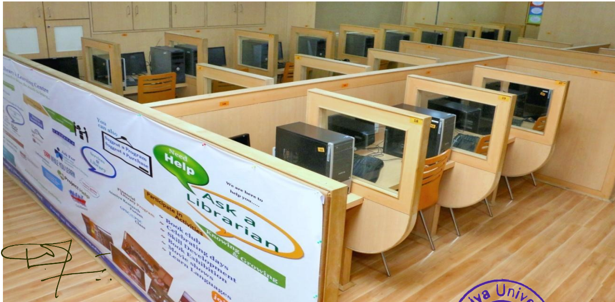
Figure 5: E-library facility in the Atmiya University Library and Learning Centre