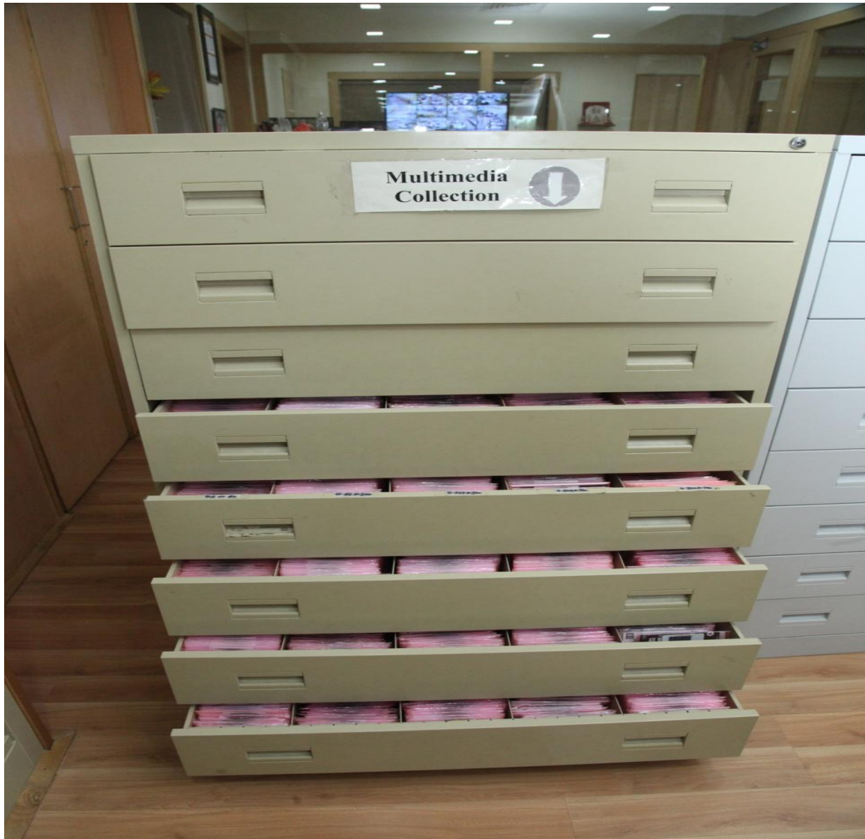
Fig 20. Multimedia rack Atmiya University Library