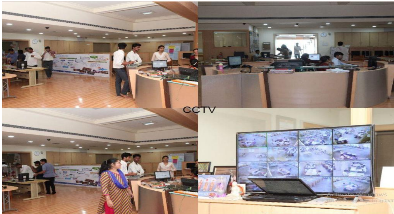
Fig 14: CCTV facility in Atmiya University Library