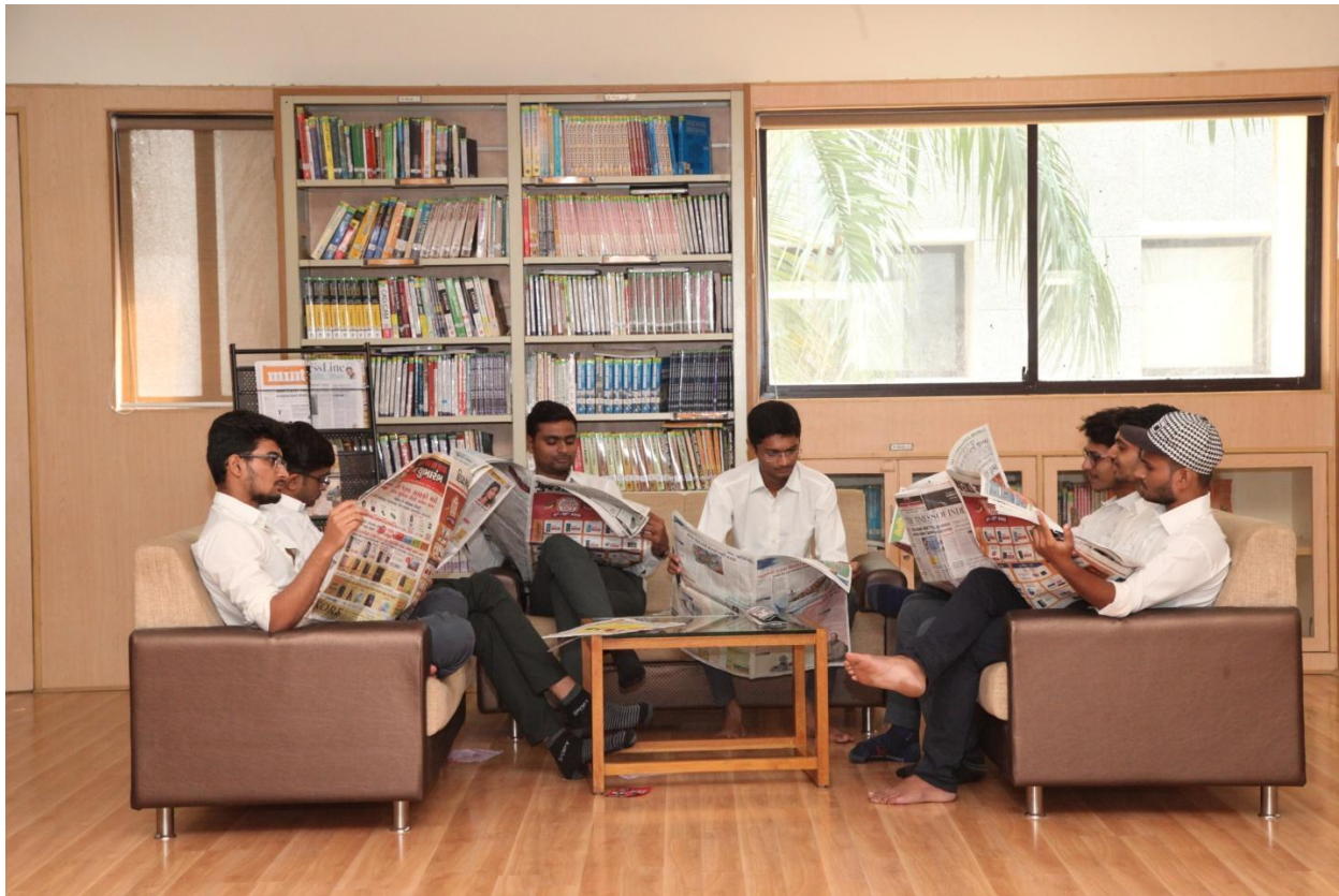
Fig 19. Newspaper reading area in Atmiya University Library