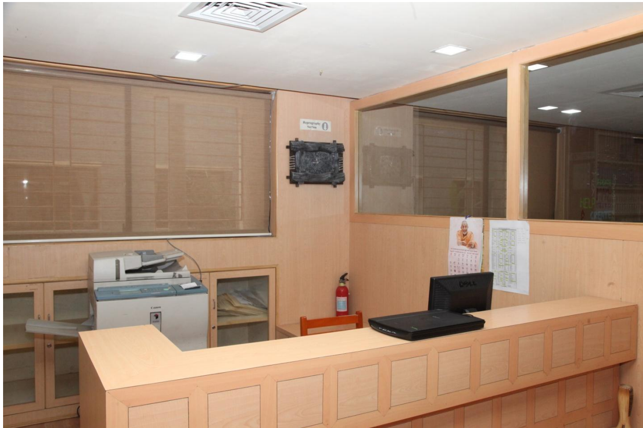
Fig 17. Reprography section Atmiya University Library