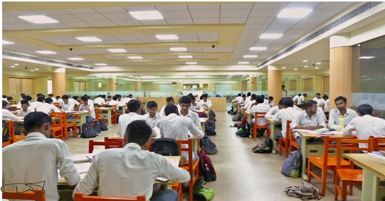
Fig 10: Reading Room Atmiya University Library