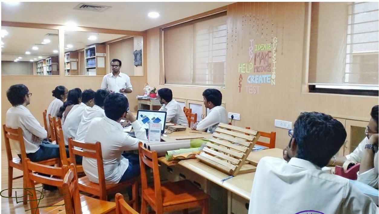
Fig 15: Makerspace Atmiya University Library