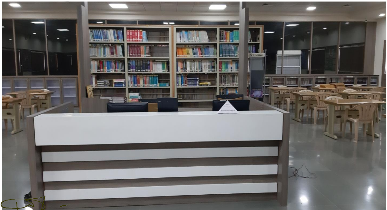
Fig 22. Circulation and stack area of Pharmacy Library, Atmiya University