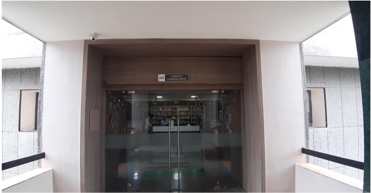
Fig 21. Pharmacy Library, Atmiya University