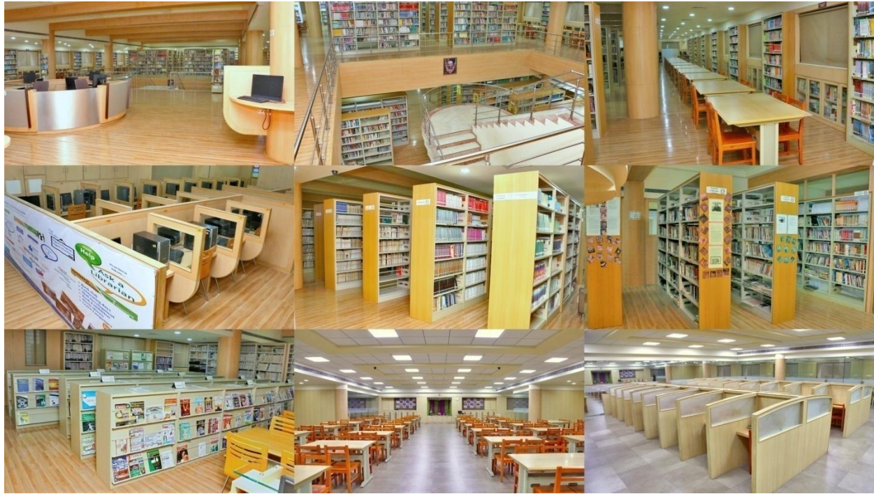
Figure 1: Overall Glimpses of Atmiya University Library and Learning Centre