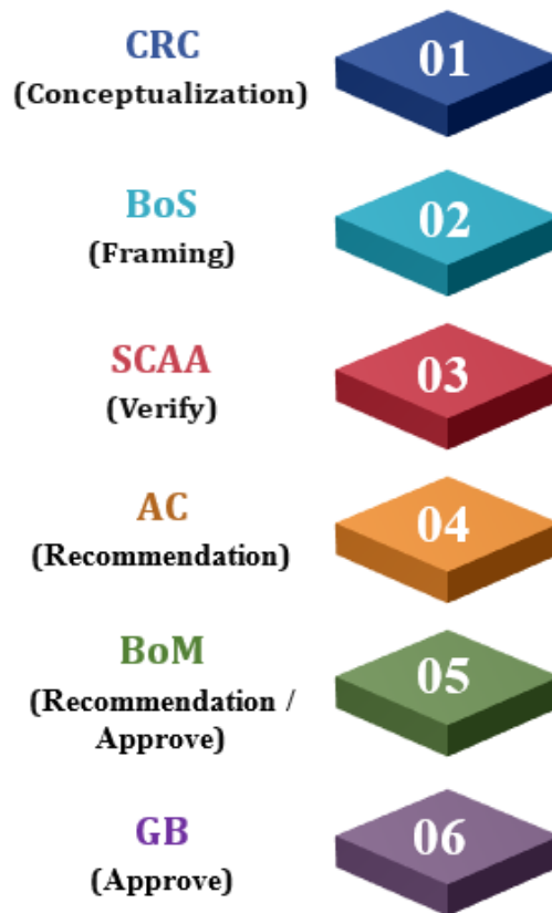
Curriculum Development Flow Chart

ensures that the curriculum framework is forward-thinking and tailored to meet evolving industry and educational requirements.