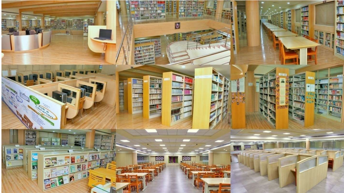
Figure 1: Overall Glimpses of Atmiya University Library and Learning Centre