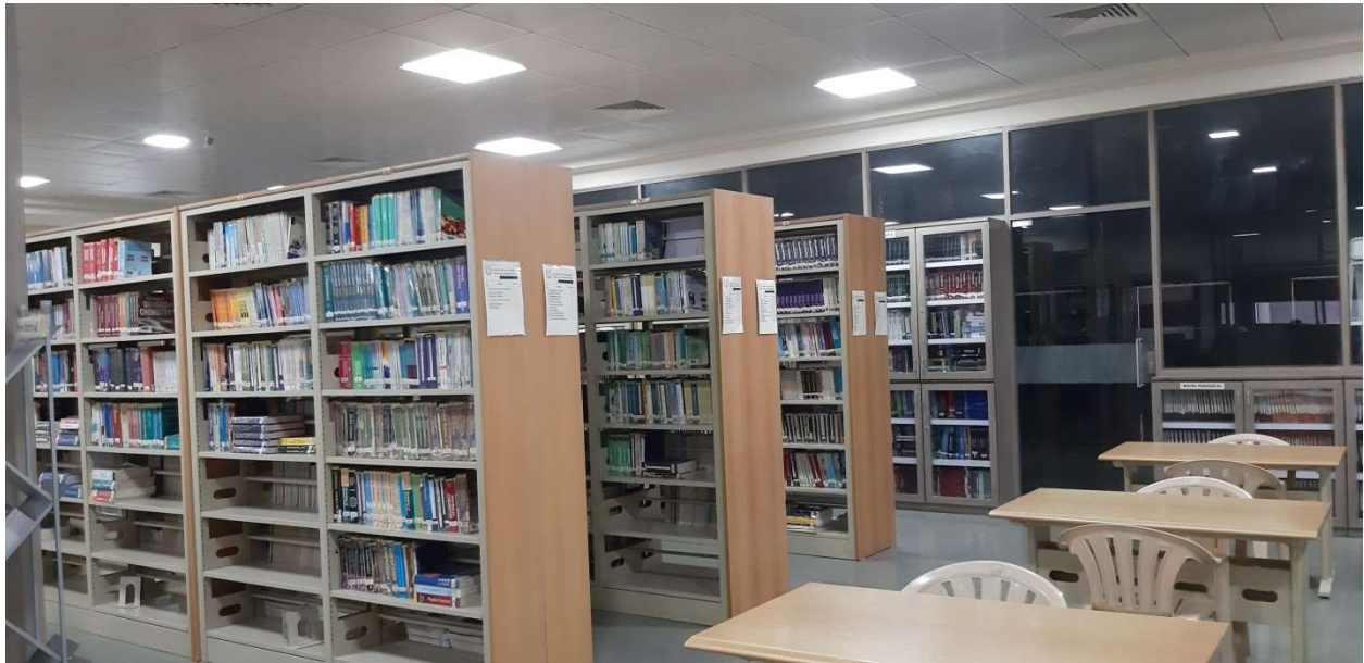
Fig 23. Stack and reading area Pharmacy Library, Atmiya University