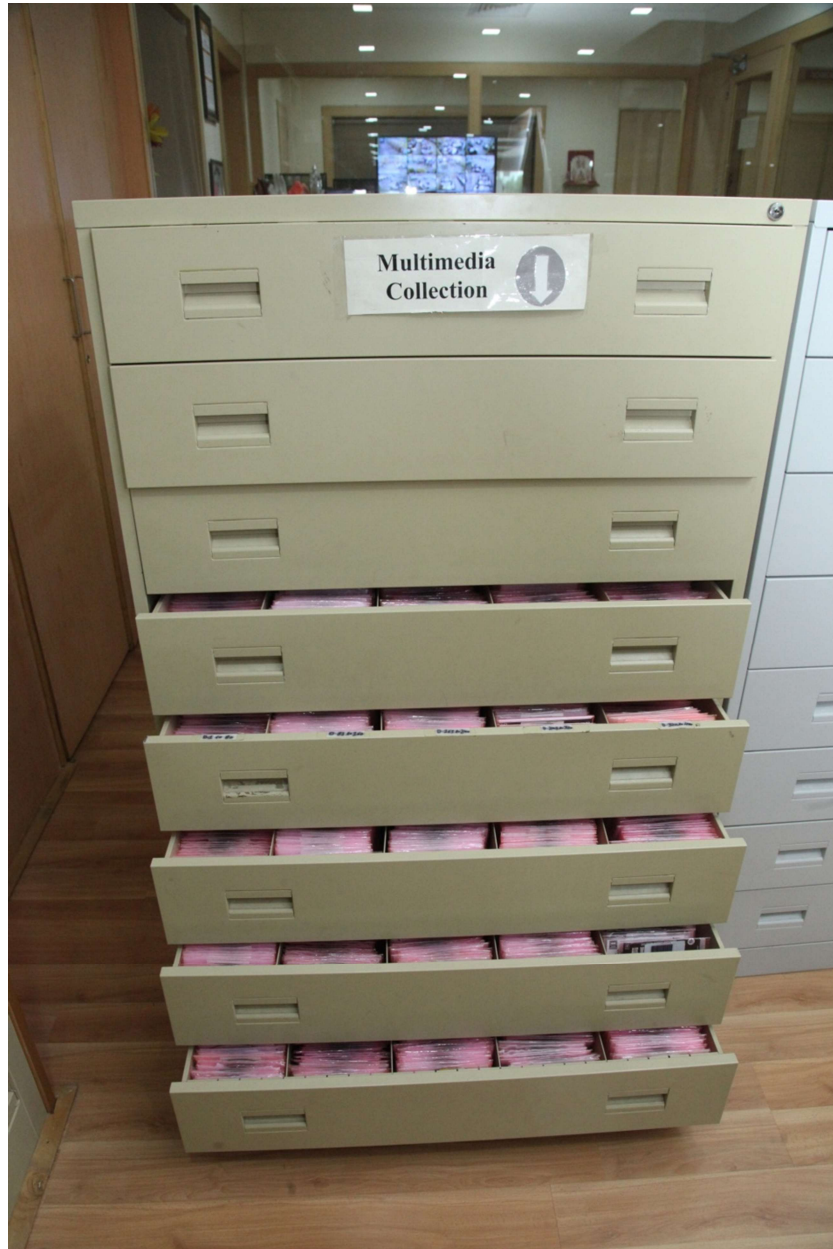
Fig 20. Multimedia rack Atmiya University Library