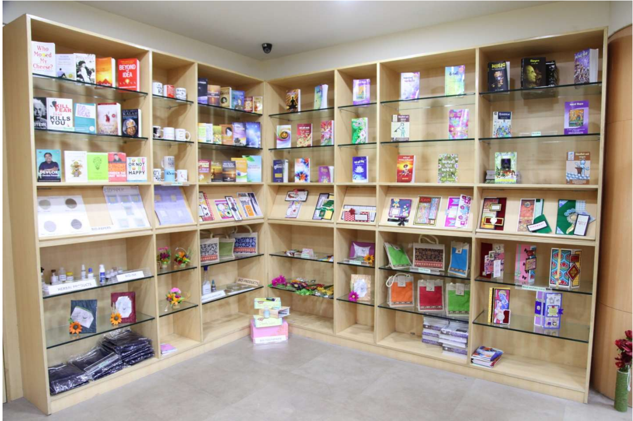
Fig 18 Bookshop in Atmiya University Library