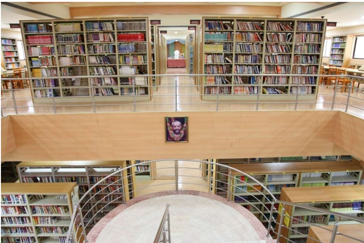
Figure 7: Books stacks shelving in the Atmiya University Library