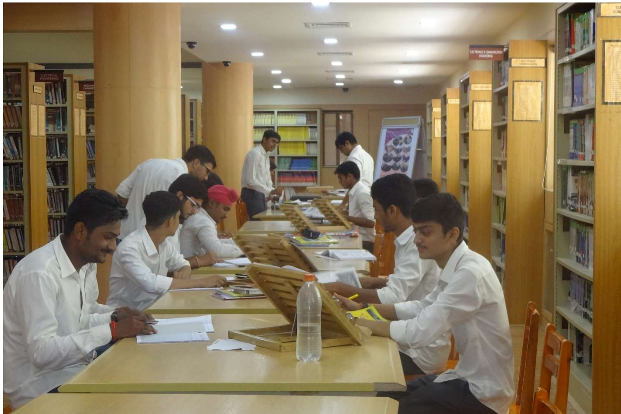
Figure 4: Reading area in the library