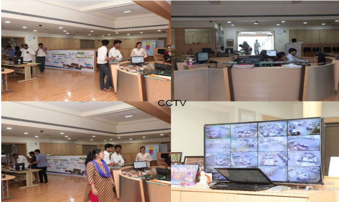
Fig 14: CCTV facility in Atmiya University Library