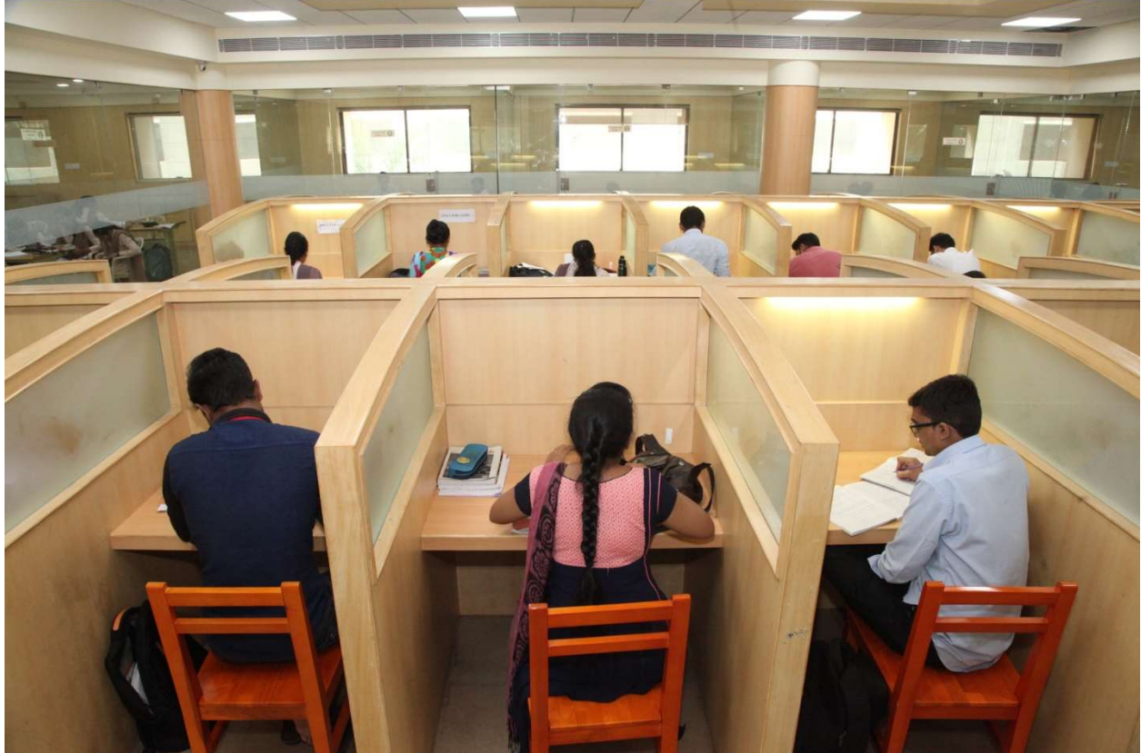
Fig 11: Reading Room – Individual study carrels Atmiya University Library