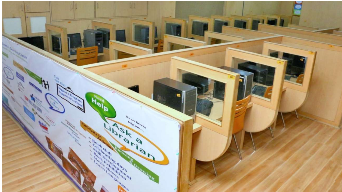
Figure 5: E-library facility in the Atmiya University Library and Learning Centre