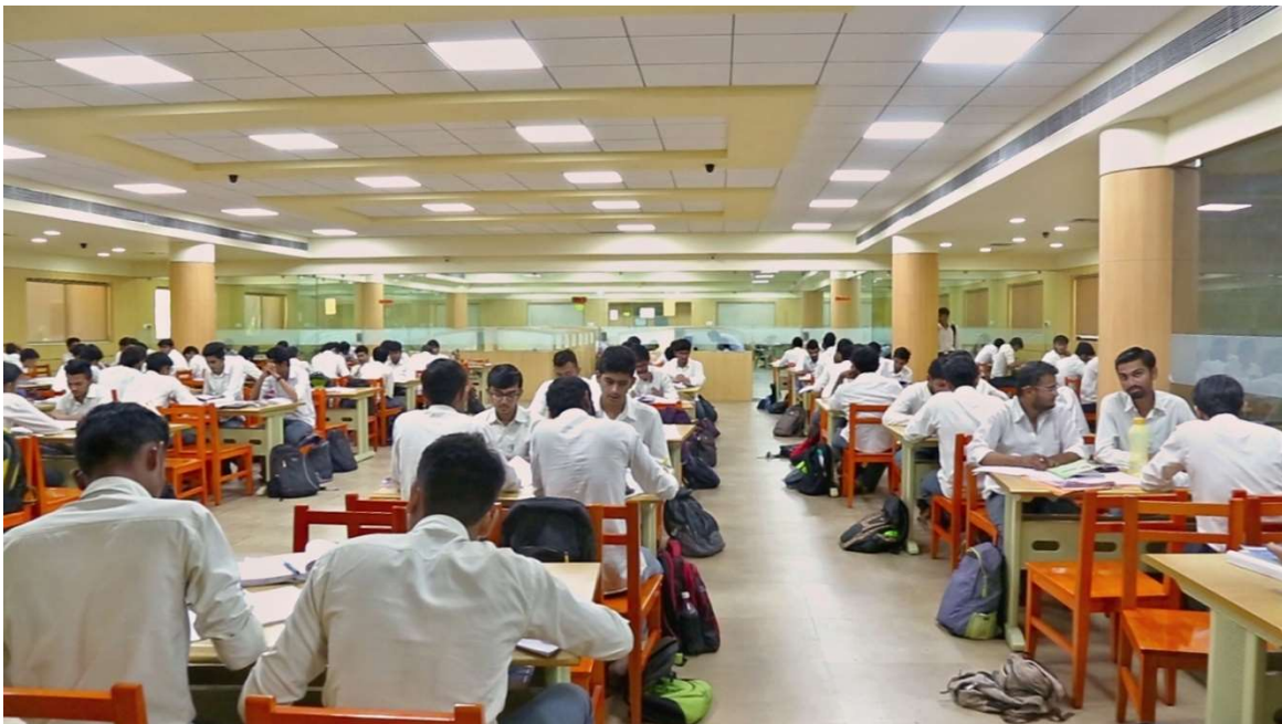
Fig 10: Reading Room Atmiya University Library