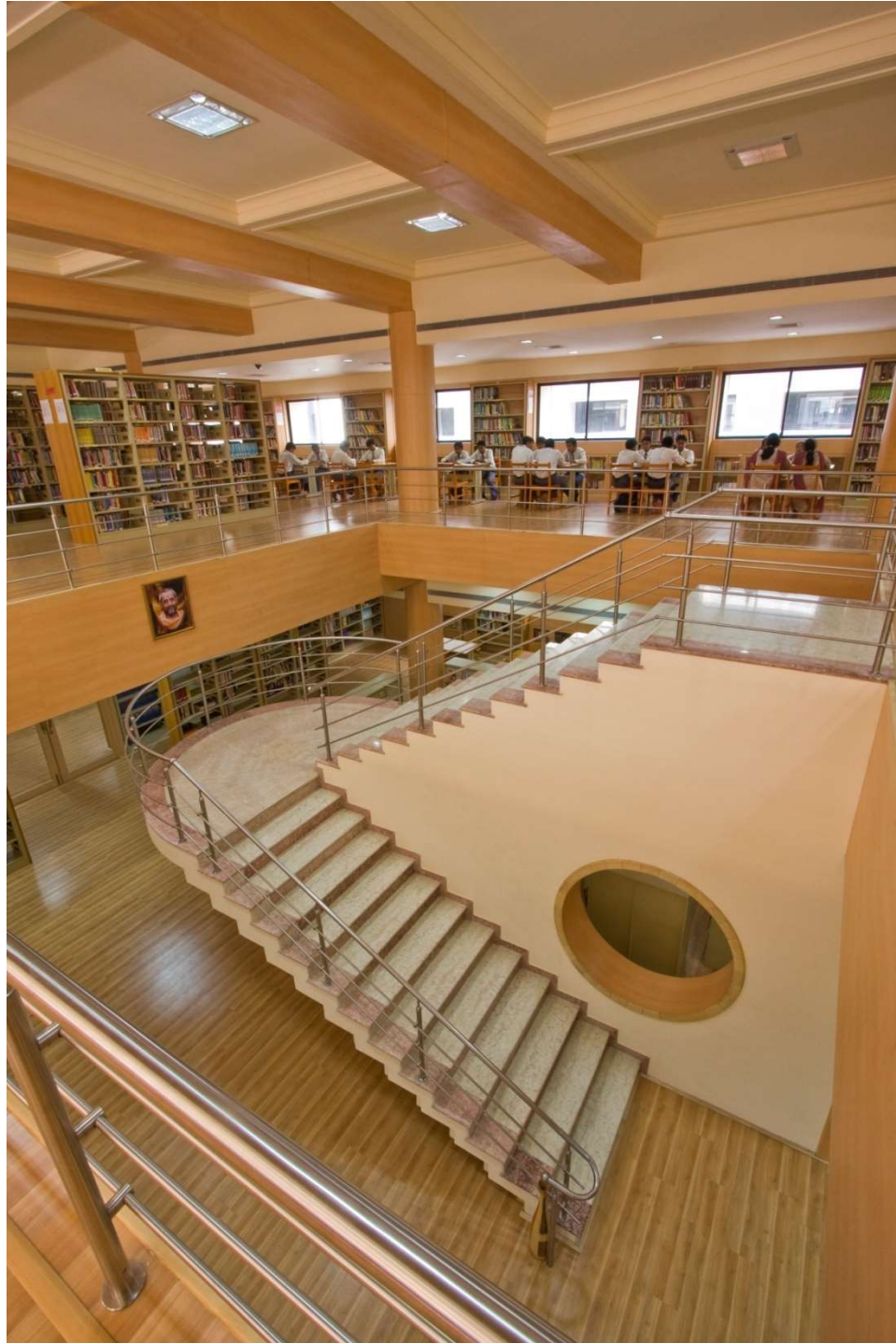
Figure 8: Glimpses Atmiya University Library