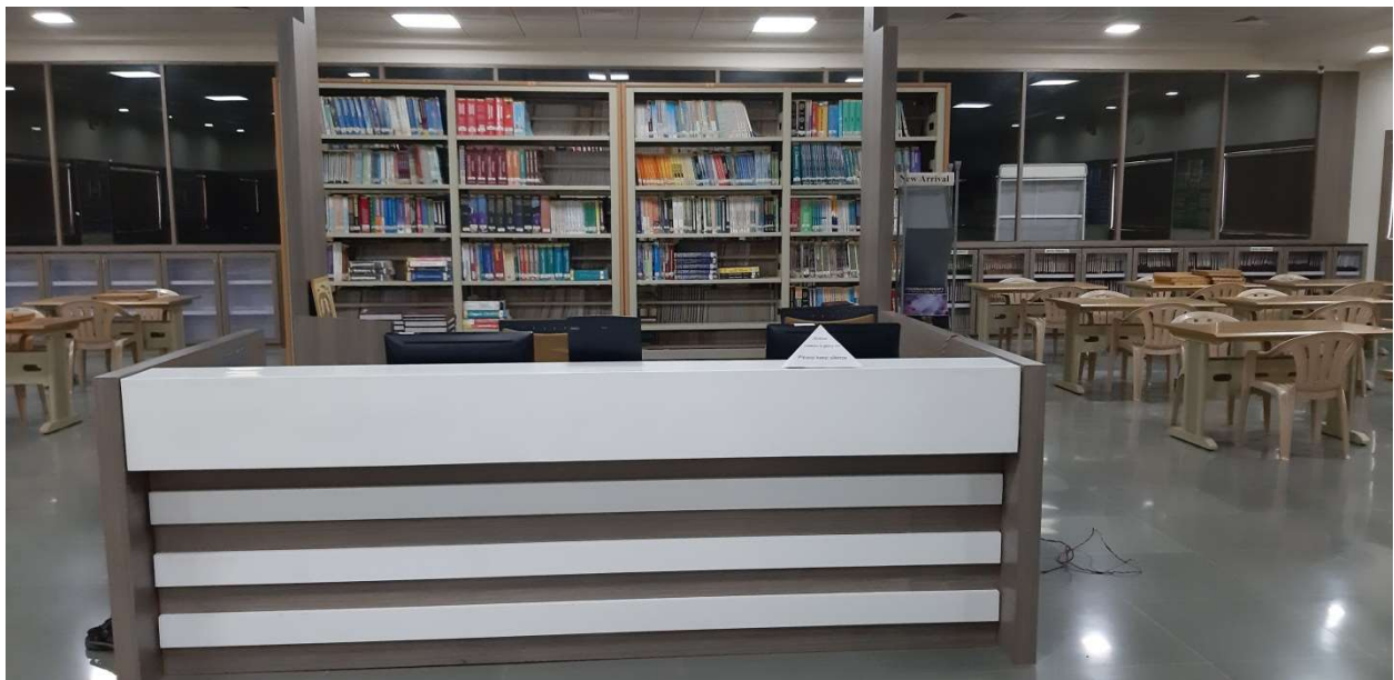
Fig 22. Circulation and stack area of Pharmacy Library, Atmiya University