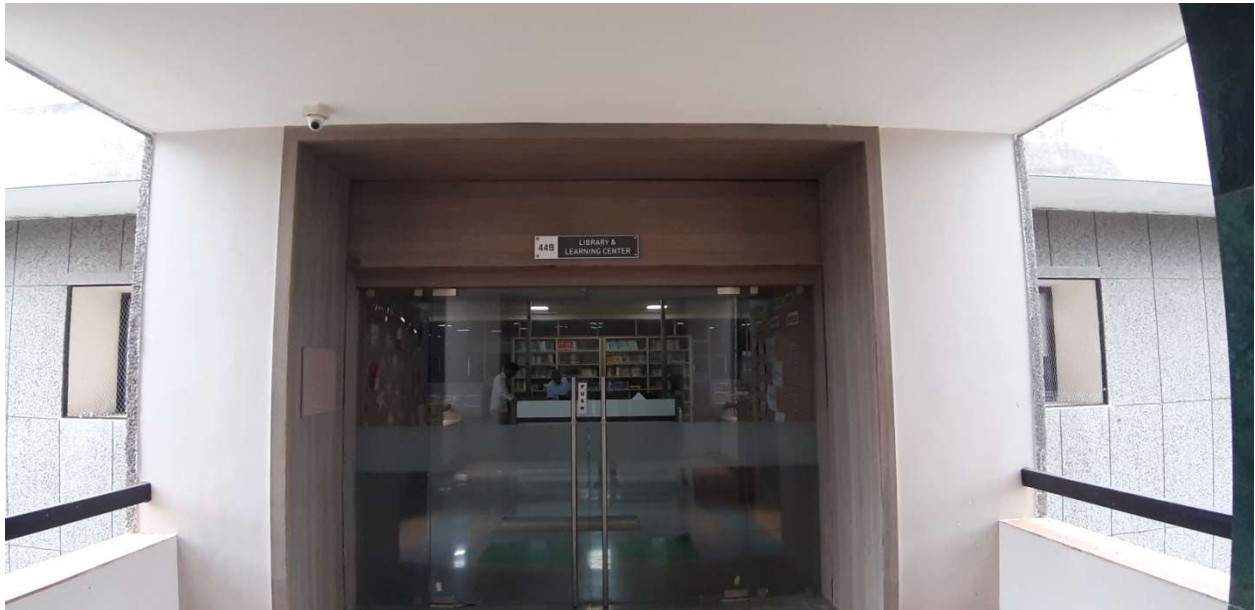
Fig 21. Pharmacy Library, Atmiya University