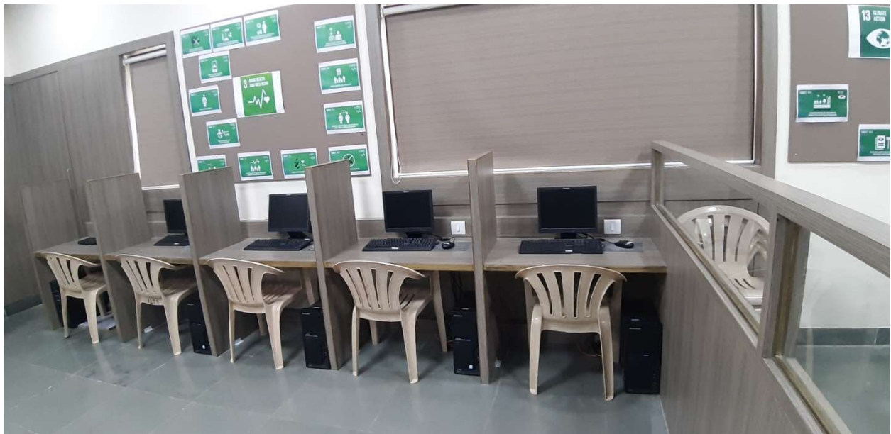
Fig 24. E-library facility Pharmacy Library, Atmiya University