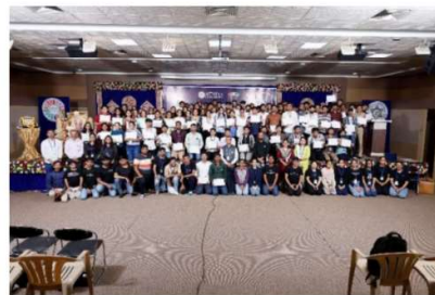
Code Carnival Participants