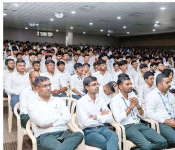
Event attendees & faculties