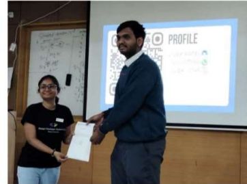
Felicitation of the Speaker