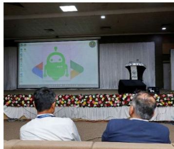
Image of Alex - The AI Host created by club leaders