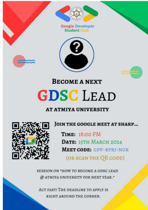
Invitation flyer of the Event