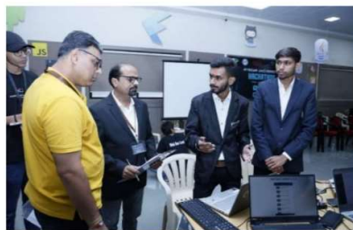
Judge Evaluation round