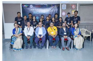
A group photo of organizers, judges, mentors and volunteers