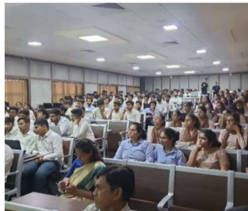
Event attendees and Faculties