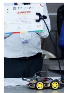
Felicitating the winner through the robot