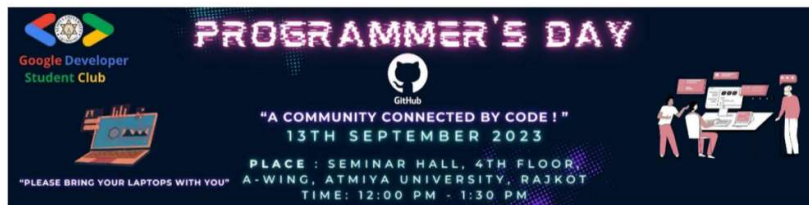
Invitation flyer of the event