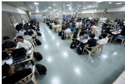
Glimpse of Hackathon