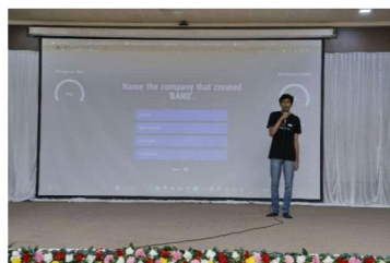
Club name reveal through the quiz game on website created by club lead members