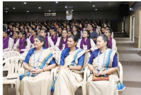
Event attendees and faculties