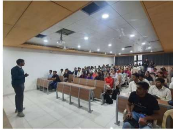
Glimpse of the Session