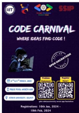
Code Carnival flyer of the event