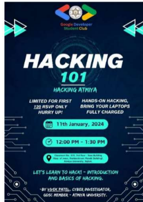
Invitation flyer of the event