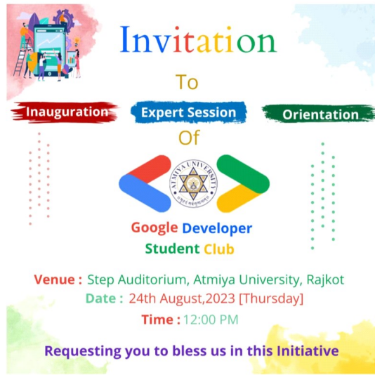
Invitation flyer of the event