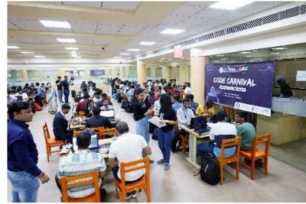
Glimpse of Hackathon