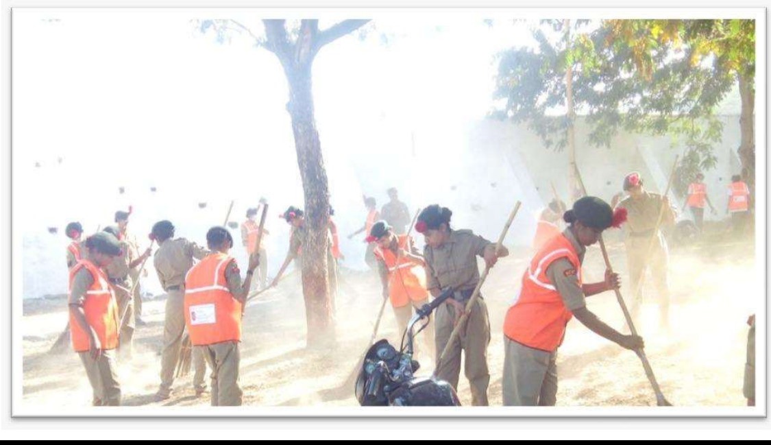
NCC Cadets cleaning public place

We went to plugging on no plastic. It was organized by NCC Unit, Atmiya University The activity was planned by our Lt S B Koradiya. There was 36 cadets. We planted A.Y. 2019-20. In these activity cadets learnt to reduce the plastic use and also to restrict use of single use plastic. They told people to use cloth bag instead of plastic bag. They picked up plastic waste from the area and make it plastic waste free.