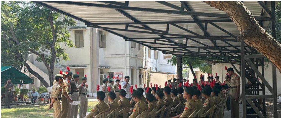
NCC Cadets With Guest Lecturer

We went to samvidhan day. It was organized by NCC Unit, Atmiya University. The activity was planned by organized by NCC Unit, Atmiya University. There were 36 cadets. We planted A.Y. 2019-20. In these activity cadets were taught about basic of constitution they were made aware of their fundamental rights and duties. They also were encouraged to follow rules laid in our constitution.