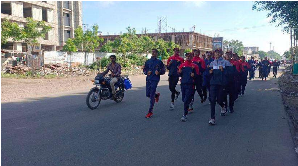
NCC Cadets Rally At Public Place

We went to rally on say no to plastic. It was organized by NCC Unit, Atmiya University The activity was planned by our Lt S B Koradiya. There was 42 cadets. We planted A.Y. 2019-20. In this activity cadets learnt to reduce the plastic use and also to restrict use of single use plastic. They also spread awareness to “say no to plastic “to the public. They told people to use cloth bag instead of plastic bag.