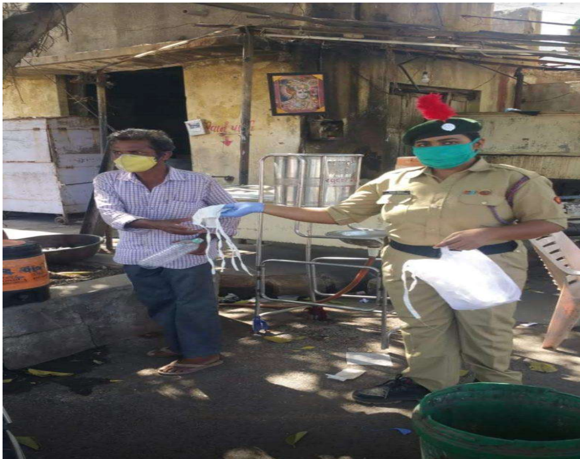
NCC Cadets Distributing Mask

We went to during lockdown duty “CORONA WARRIOR “it was organized by NCC Unit, Atmiya University The activity was planned by our NCC Unit, Atmiya University co sir. There was 36 cadets. We planted date 02-04-2020 & 20-05-2020. In these activity cadets guide the people and encourage them to wear mask, use sanitizer, keep social distance, take care of their health. This activity developed spirit of social work in cadets.