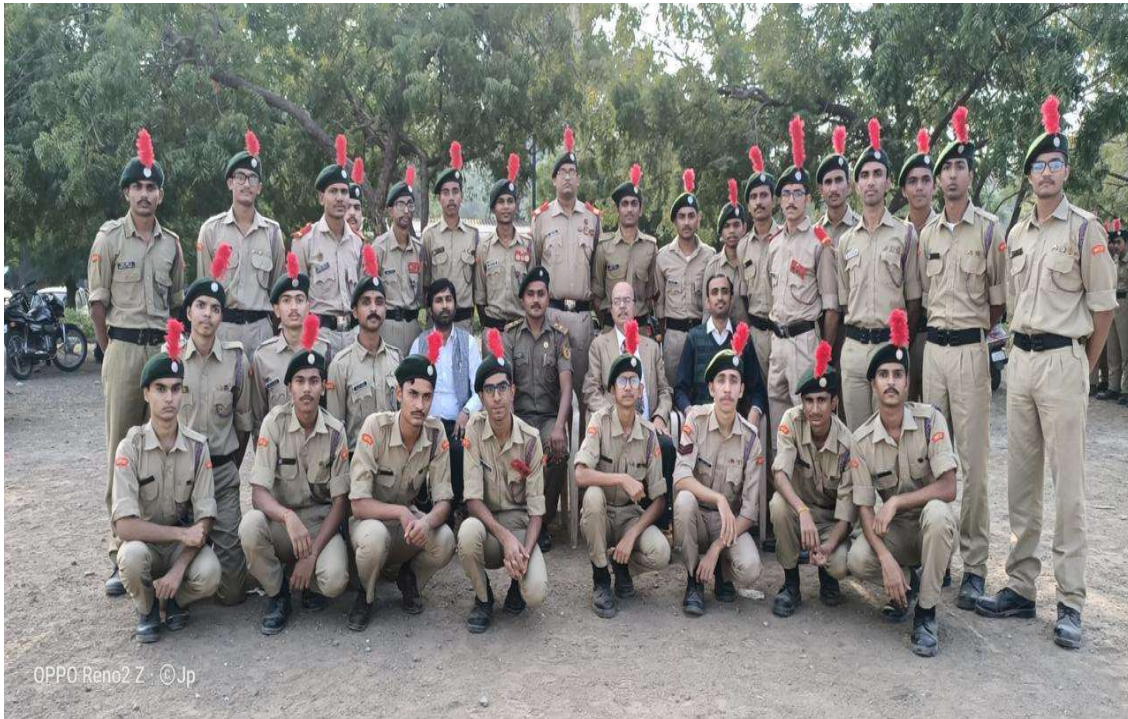
NCC Cadets with guest