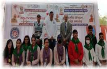
Donors Donating Blood and Group Photos of The Blood Donation Camp