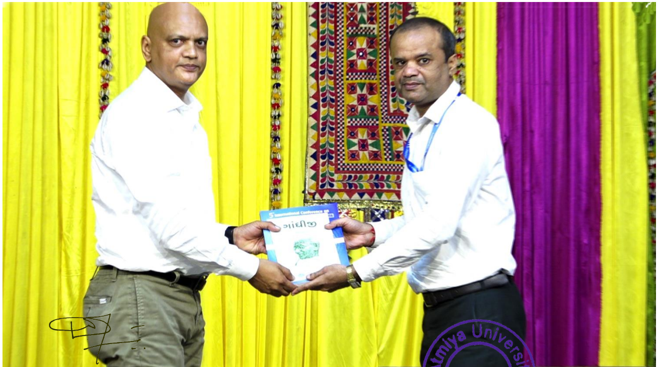
Registrar Atmiya University Rajkot