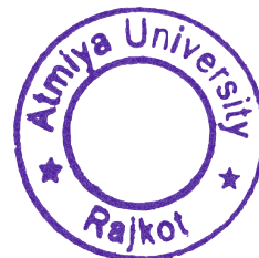
Registrar Atmiya University Rajkot