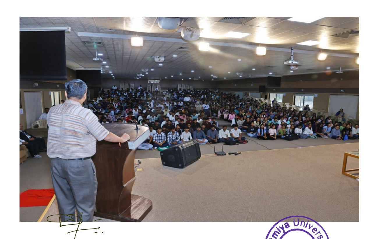
Registrar Atmiya University Rajkot