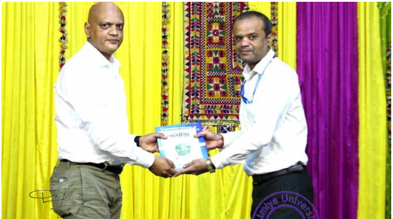
Registrar Atmiya University Rajkot