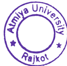
Registrar Atmiya University Rajkot